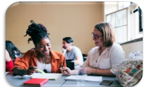
Cross Community Collaboration