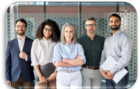
James D. Prosser Excellence in Government Leadership

Submission Deadline: August 16, 2024 (nomination period opens June 10 th )