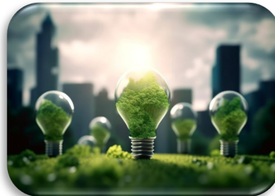
Clean Cities & Communities