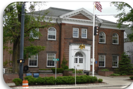
Local Government Innovation