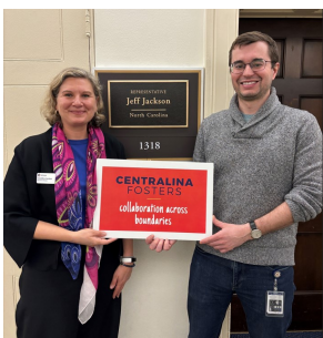
Jeff Jackson's Office

After their meeting with the Senators, they met with U.S. Representative Alma Adams's staff. They expressed thanks for Congresswoman Adams's support and assistance with the North Mecklenburg County Housing Preservation Initiative. Additionally, they met with DC staff for U.S. Representative Jeff Jackson to reiterate Centralina's request for the Congressman's support for the Brownfields grant. Within 24 hours after the meeting, Congressman Jackson sent a letter of support to the Environmental Protection Agency.