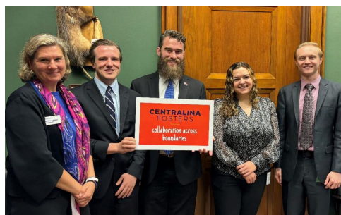
Thom Tillis' & Ted Budd's Office