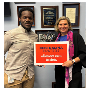
Alma Adams' Office