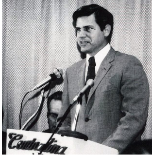
Former Board Chair & NC Governor Dr. James G. Martin

With the region growing rapidly by the 1990s, it was evident that local governments needed to focus on collaboration to coordinate on growth and economic development in response to the continued decline of the region's textile industry.... continue reading