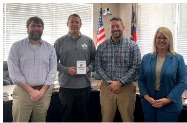
City of Lowell