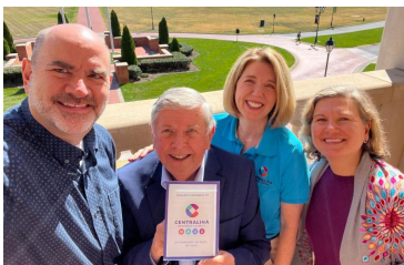
City of Kannapolis

Thank you to all the communities who have welcomed our team with open arms during our road trip series this fall. We're hoping to wrap up our final visits around the region in time for the holiday season. Here are some highlights from our community visits this past month!