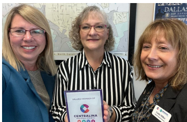
Town of Dallas