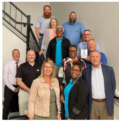
City of Kings Mountain