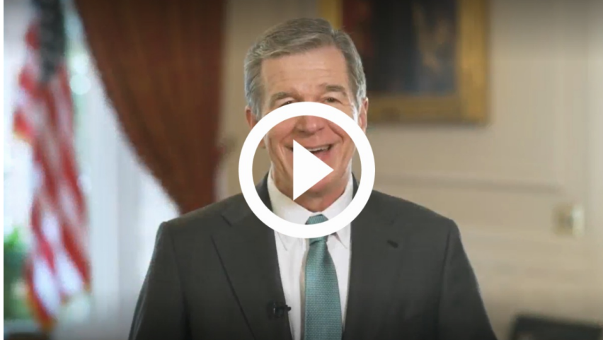
Remarks from United States Senator for North Carolina Thom Tillis