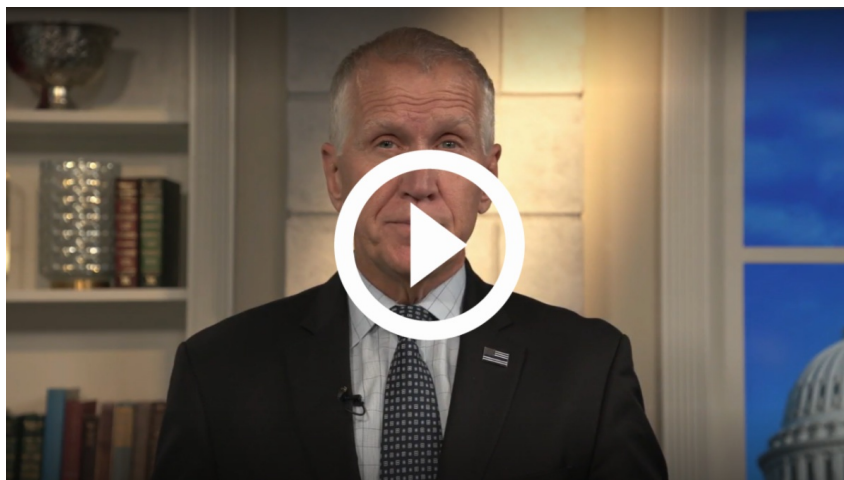
Written Remarks from United States Congressman Jeff Jackson