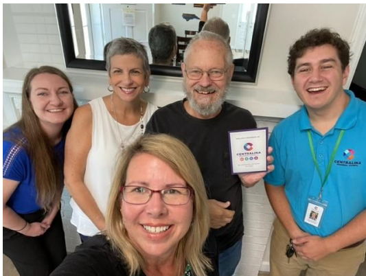
Village of Misenheimer

We're halfway through our Regional Road Trip visits to all of our 55 municipal member governments! Here are some recent highlights: