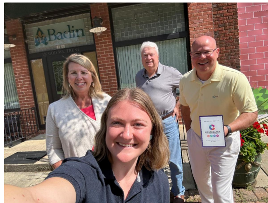
Town of Badin