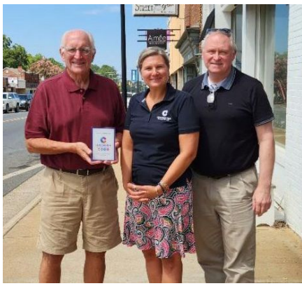
Town of Norwood