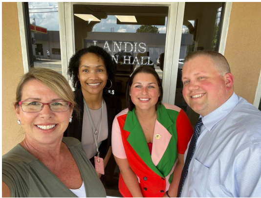
Town of Landis

In August as part of our anniversary celebration, we kicked off our "Regional Road Trip" series with visits to the towns of Huntersville and Mooresville. The following are some of the other member communities that we've had the pleasure of visiting recently.