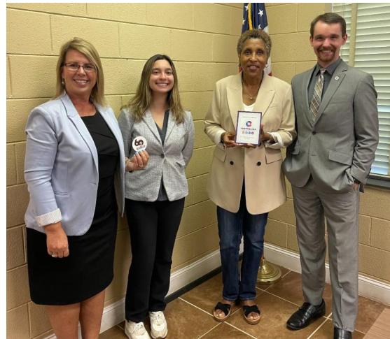
Town of Ranlo