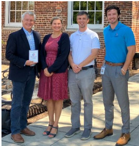
Town of Waxhaw