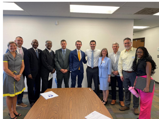
August advocacy meeting with Congressman Jeff Jackson, featuring community representatives from Lowell, Gastonia, Ranlo, Pineville, Cramerton and McAdenville

Read More About Our August Advocacy Efforts