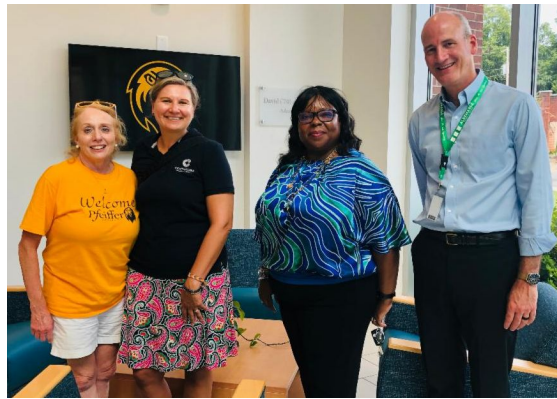
City of Albemarle