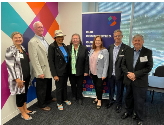
August advocacy meeting with Congresswoman Alma Adams, featuring community representatives from Cornelius, Davidson, Kannapolis, Mint Hill, Huntersville, Mooresville and Mecklenburg County

In August, the House and Senate are adjourned and members of Congress traditionally spend their time in their congressional districts. Members of Congress refer to this as the “District Work Period” and use it to meet with constituents and participate in local public events. Centralina takes advantage of the district work period to meet locally with our Congressional Delegation to discuss our regional priorities and federal action agenda. This past month, we held meetings with U.S. Representatives Alma Adams and Jeff Jackson with record attendance at both! In these sessions, we shared information on our work to increase regional mobility and advance workforce development. We also highlighted the importance of continued flexibility in the aging programs we administer.