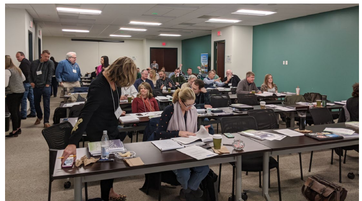
Centralina Regional Council, January 2019

Centralina Regional Council and the UNC Chapel Hill School of Government have provided