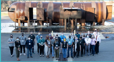
Photo: The 2022 CLT Aviation Academy class visit to the Charlotte Fire Department Live Burn training site