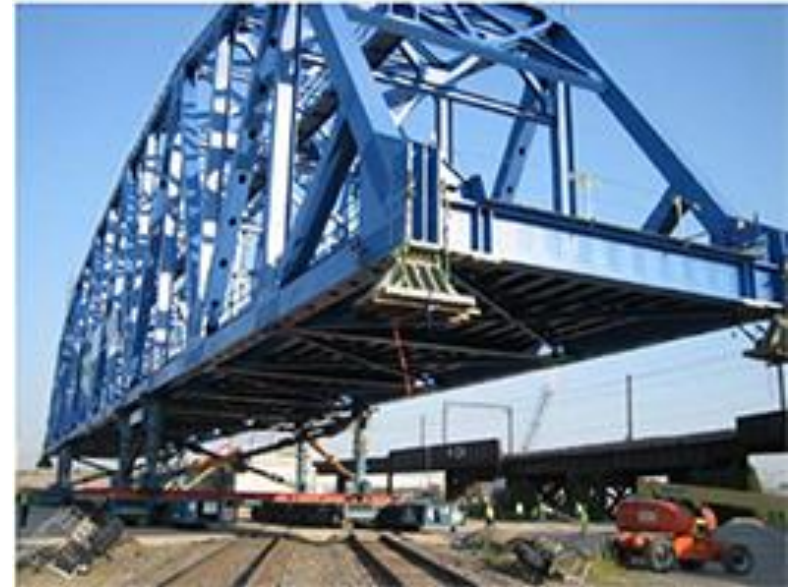
CREATE grade separation project GS15a under construction at 130th St. and Torrance Ave. in Chicago