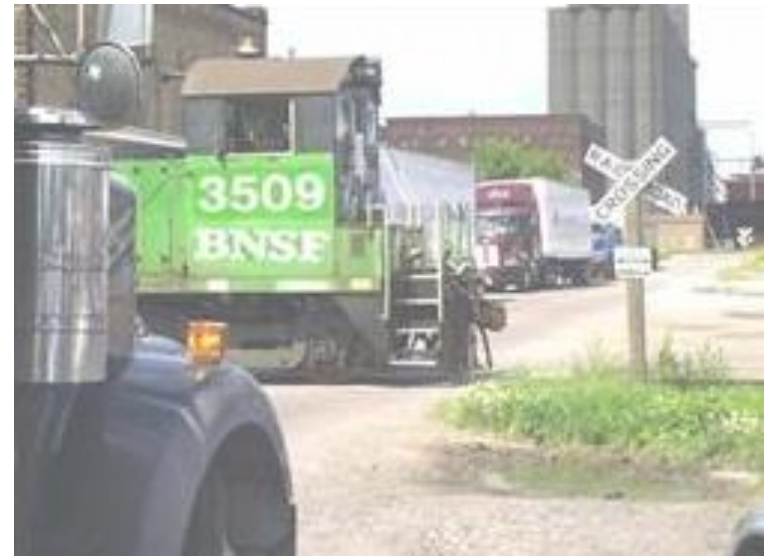
Image of freight train and motor carriers serving the Port of Duluth-Superior.