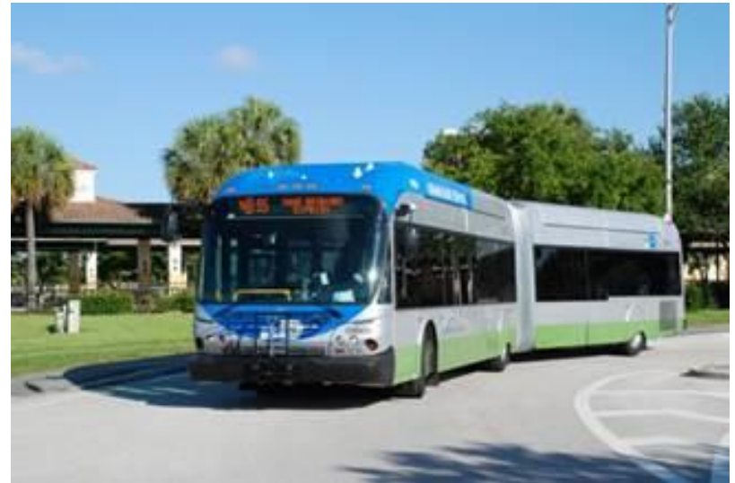
Miami-Dade/Broward 95 Express Bus.